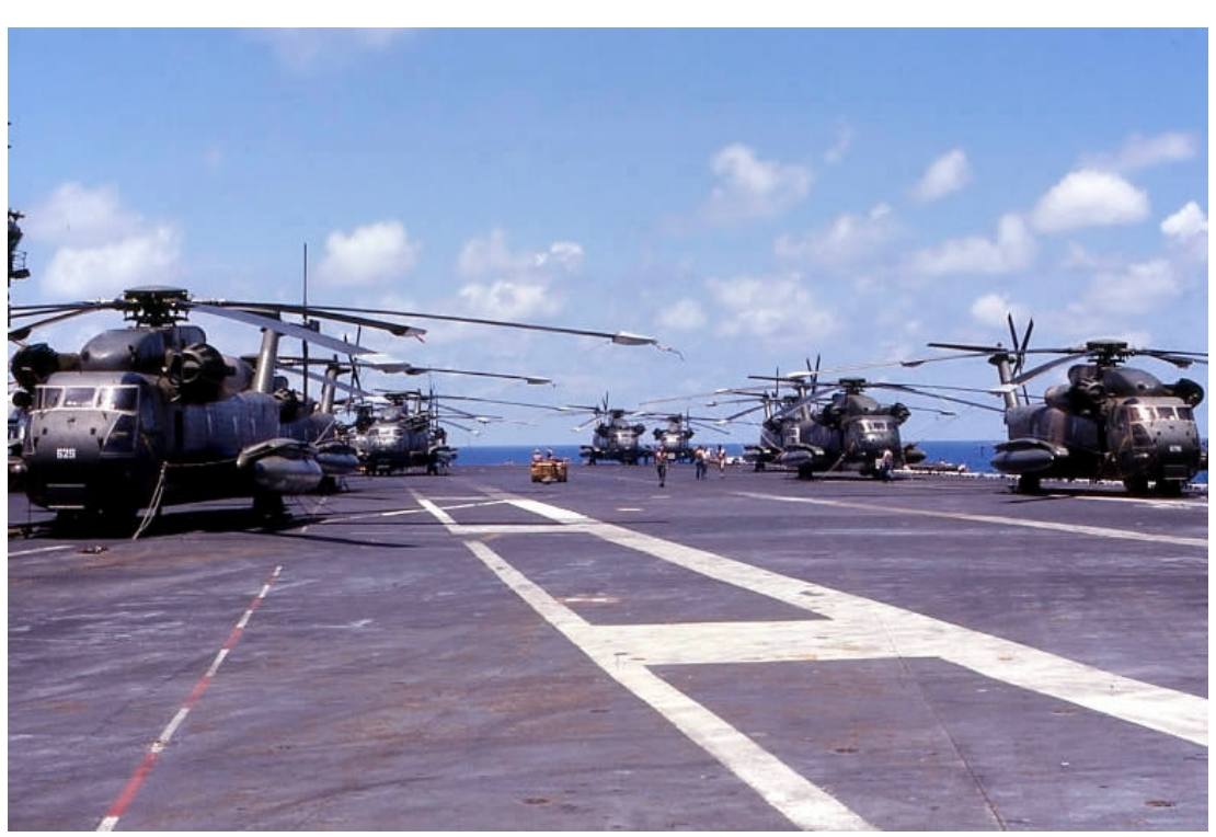
"GONE BUT NOT FORGOTTEN"